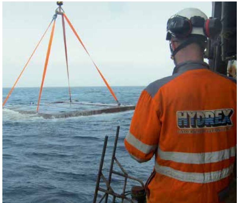
Hull repair on a drill ship in the Gulf of Mexico in 2018