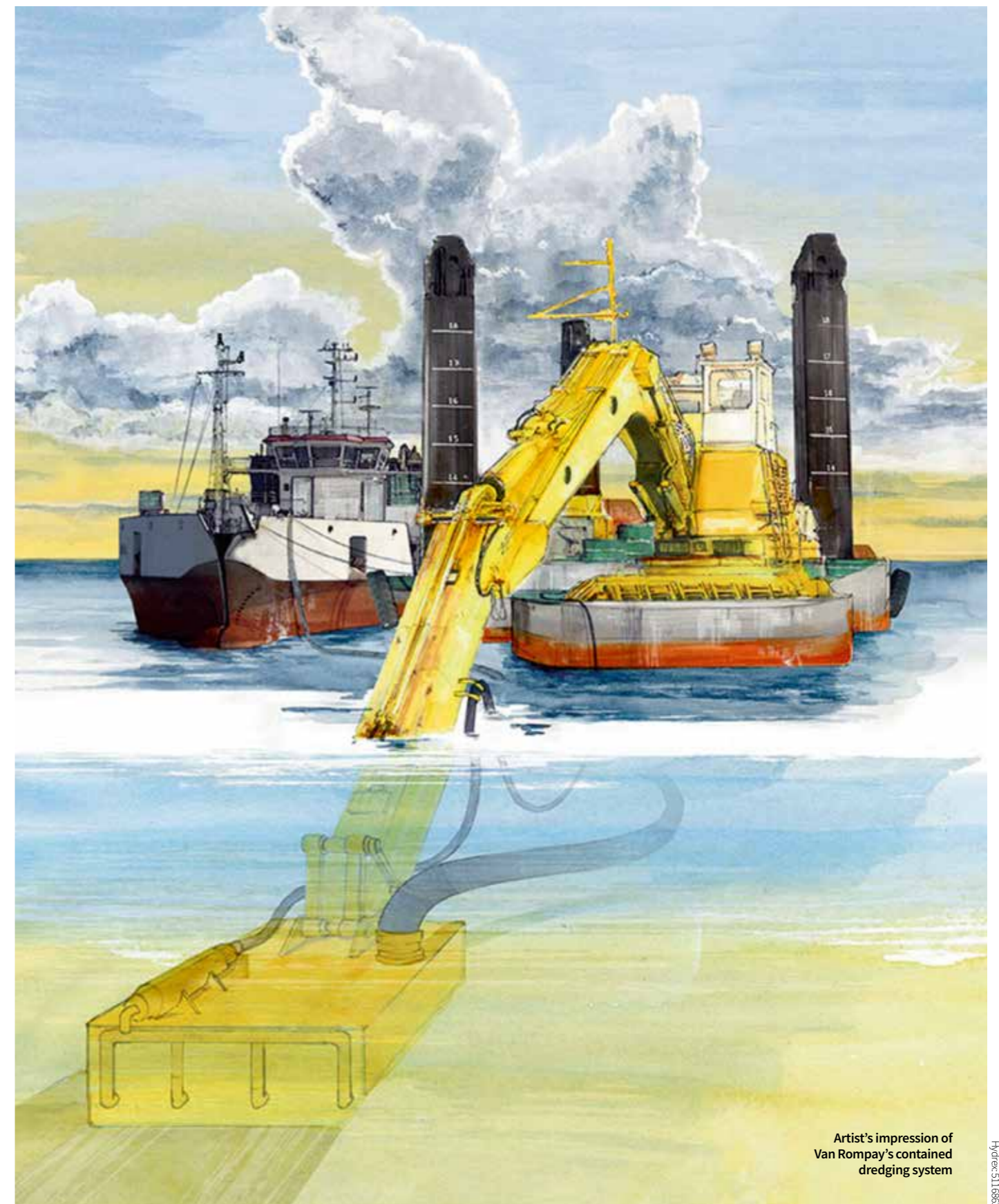
Artist’s impression of Van Rompay’s contained dredging system

He added, “Our work procedures are authorised by all the major classification societies and meet the highest